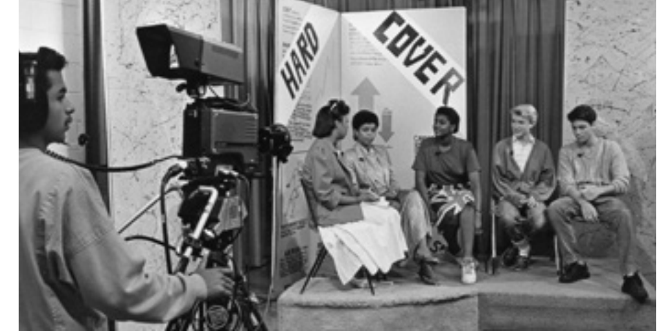
The first ever "Hard Cover: Voices and Visions of Chicago's Youth" season in a shoot at CAN TV-Chicago's cable access TV station 1986 (temporarily located at the University of Illinois Chicago)